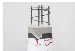
Column formers Tubbox® - blowhole-free finish