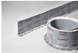
Metal waterstop Fradiflex®