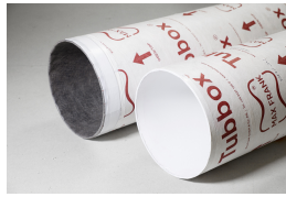
Column formers Tubbox®