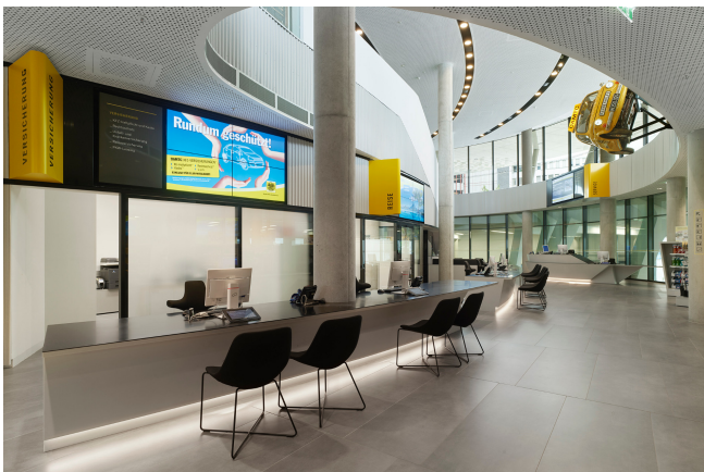
ÖAMTC headquarters Vienna © Pichler & Traupmann Architekten ZT GmbH, Foto: Roland Halbe