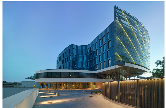
ÖAMTC headquarters Vienna © Pichler & Traupmann Architekten ZT GmbH, Foto: Roland Halbe