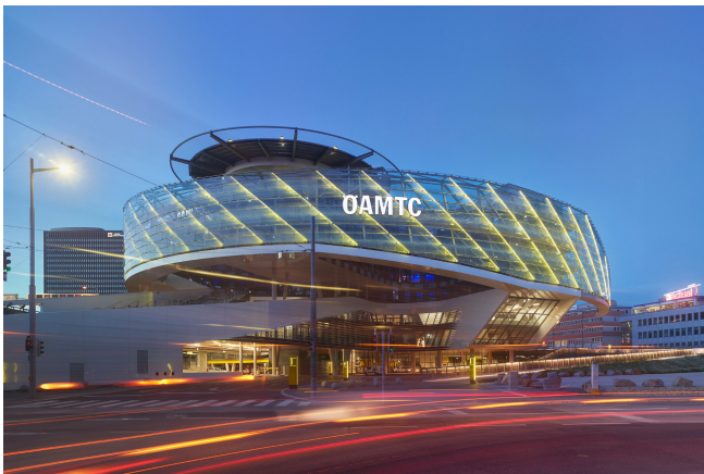
ÖAMTC headquarters Vienna © Pichler & Traupmann Architekten ZT GmbH, Foto: Roland Halbe