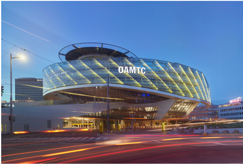
ÖAMTC Zentrale in Wien

© Pichler & Traupmann Architekten ZT GmbH, Foto: Roland Halbe