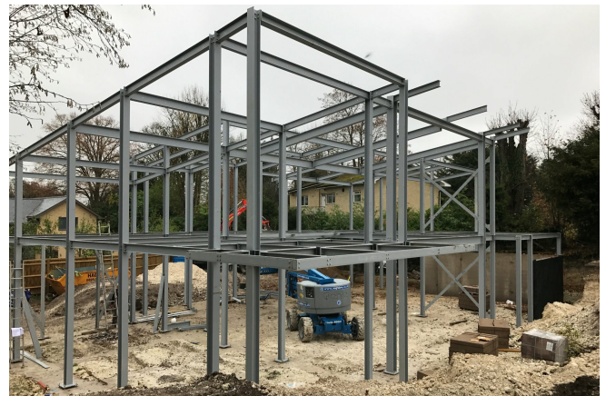
Residential building with Egcobox® FST © www.maxfrank.com