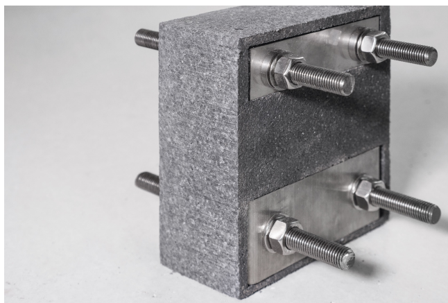
Residential building with EgcoBox® FST