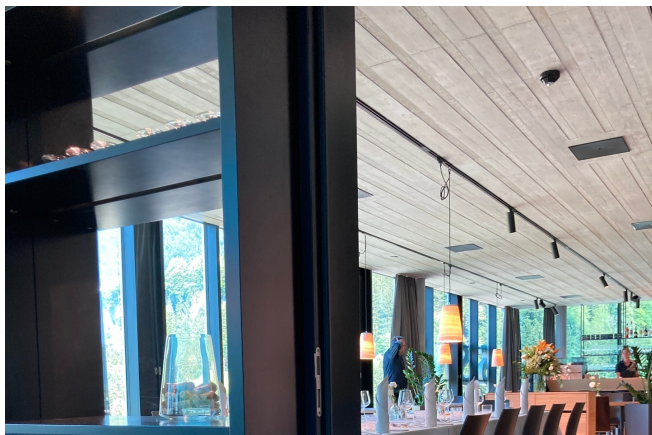
Restaurant "54"