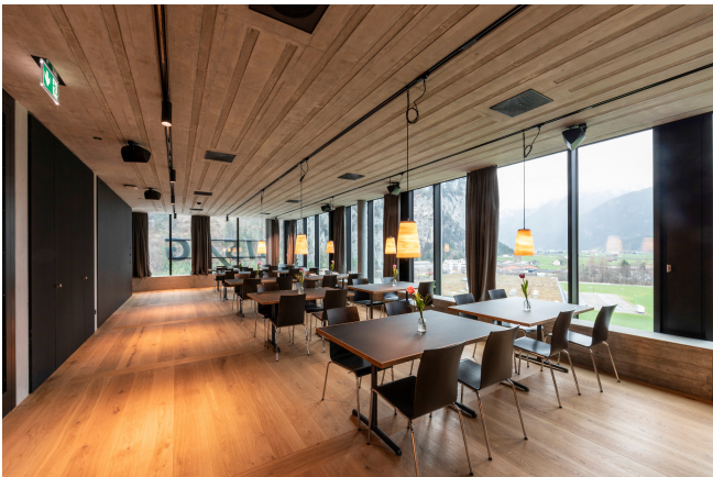
Restaurant "54"