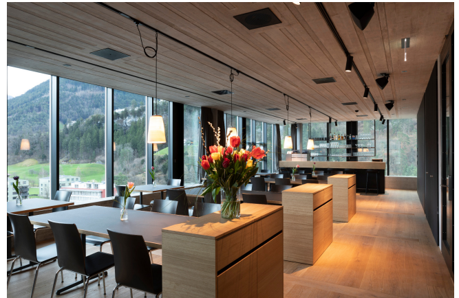
Restaurant "54"