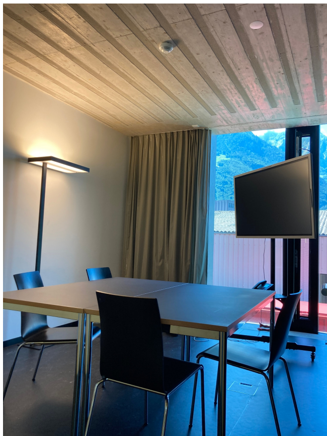
Meeting Room