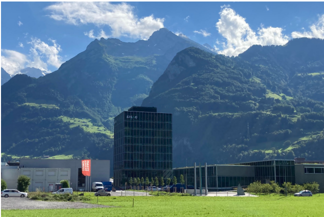
SisCampus Schattdorf