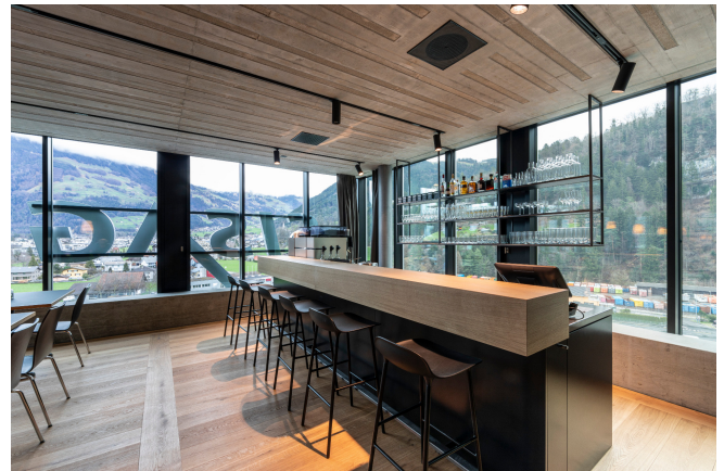
Restaurant "54"