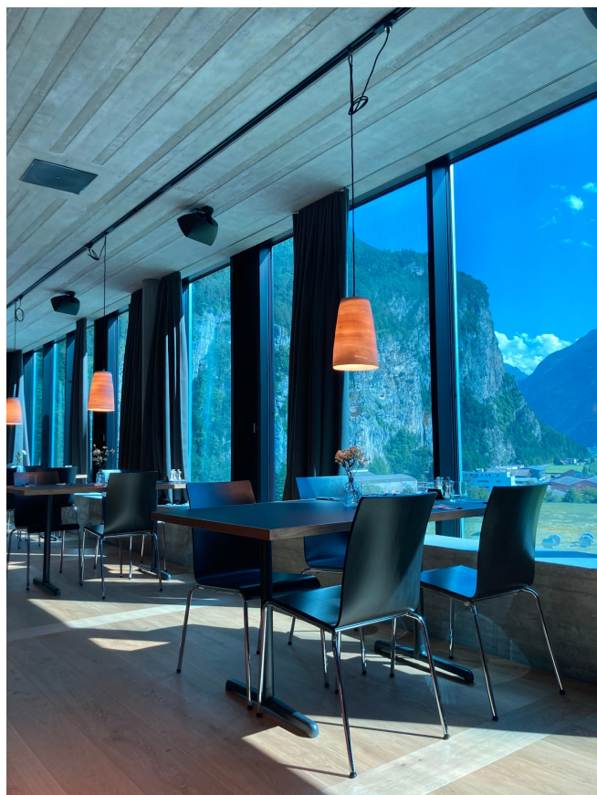
Restaurant "54"