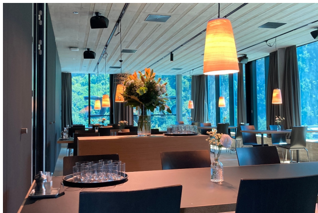
Restaurant "54"