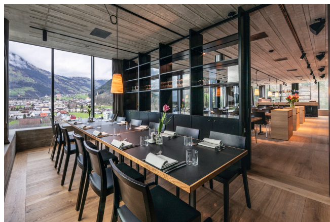
Restaurant "54"