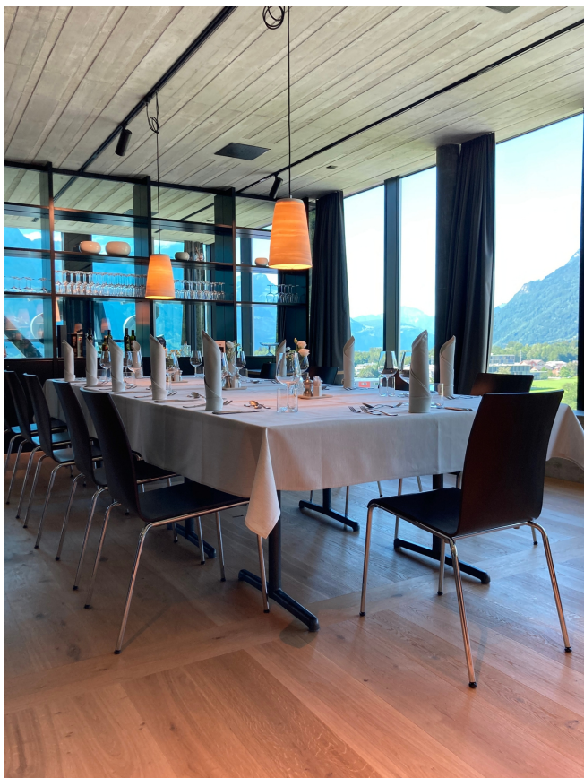
Restaurant "54"