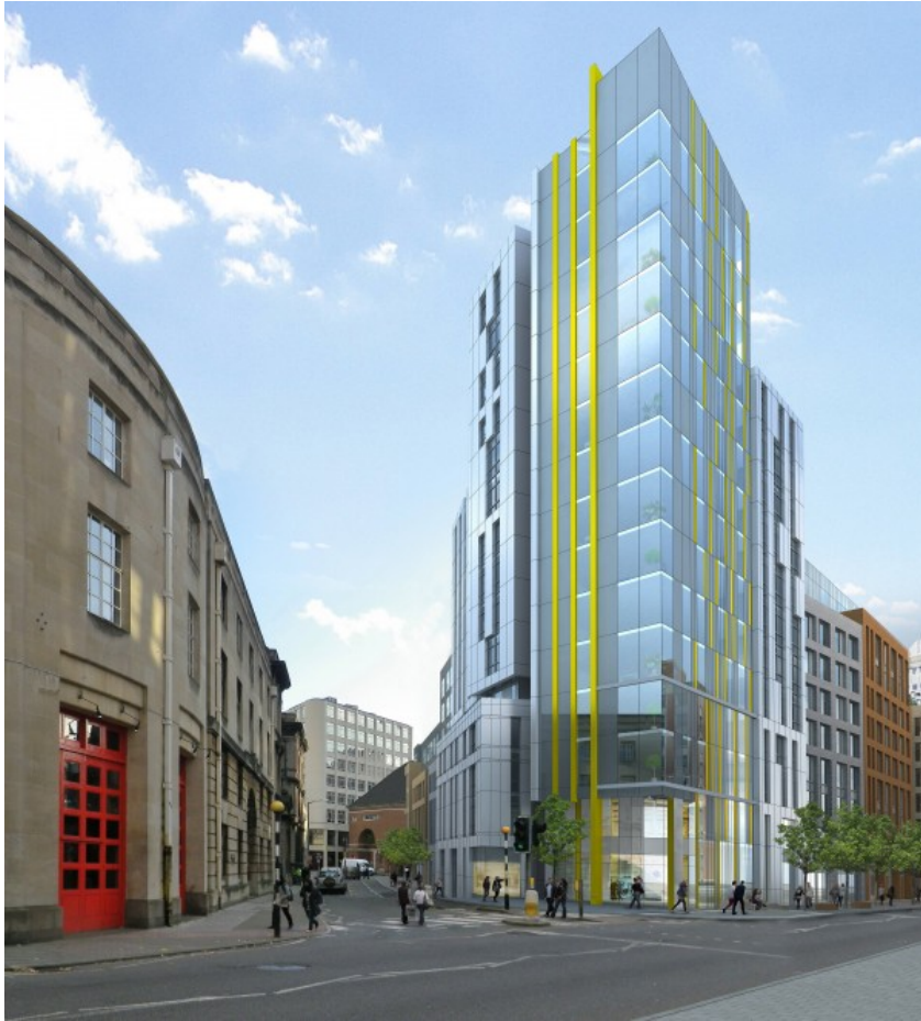
New Bridewell Street © 4D Structures