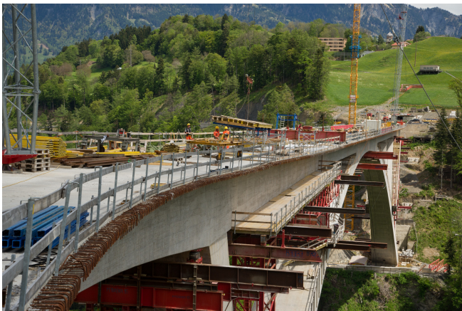
Tamina Valley Bridge