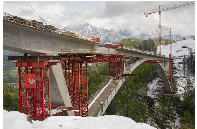
Tamina Valley Bridge