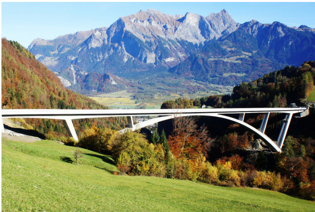
Tamina Valley Bridge