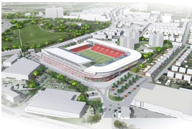
Bristol City FC and Rugby Club