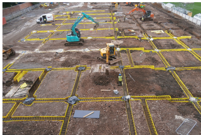
Pecafile® - Bristol City FC and Rugby Club © www.maxfrank.com