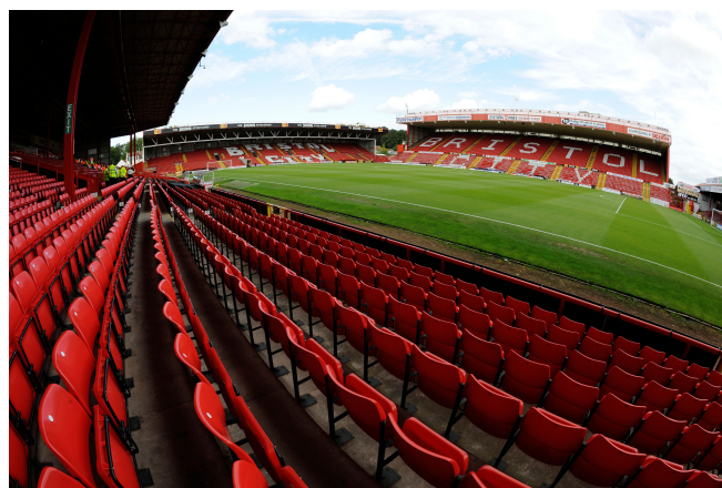
Bristol City FC and Rugby Club