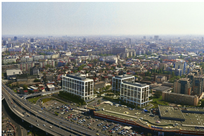
Business Garden Bucharest