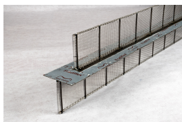
Stremaform® forskaling for arbeidsfuger som holdes på plass