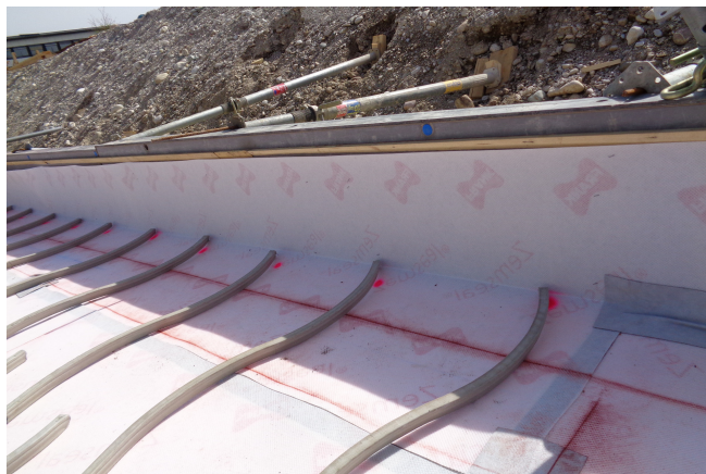
Base slab to wall