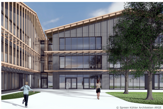
Realschule Trostberg © Spreen Köhler Architekten ARGE