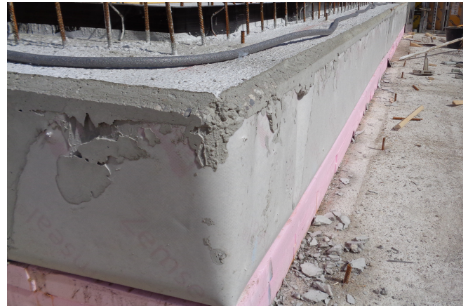
Edge with Zemseal® and Fradiflex®