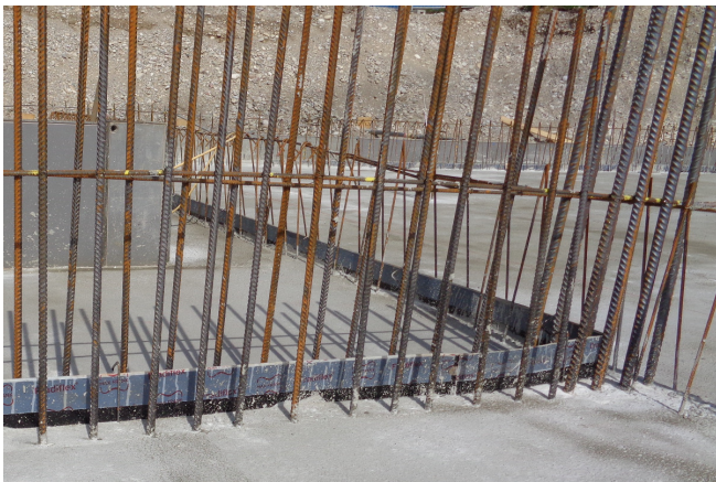
Fradiflex® Premium metal water stop