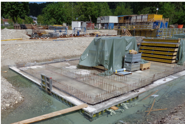
Construction area with ground water