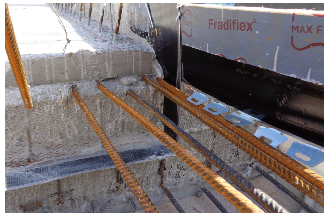
Stremaflex® combined with Fradiflex® with fixing angels