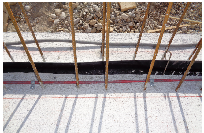
Redundant cold joint waterproofing