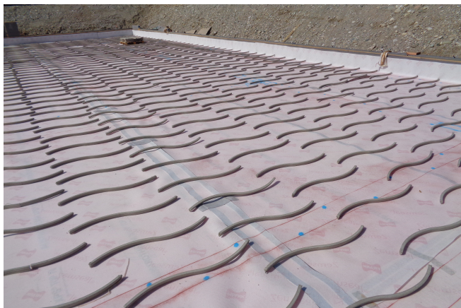
Waterproofing membrane combined with snake type spacers