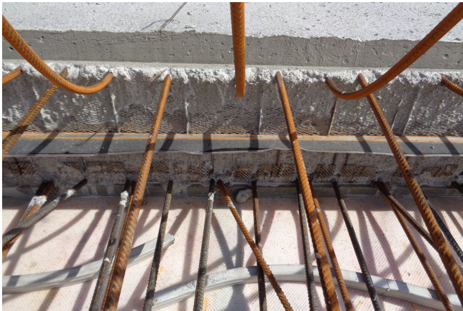
Formwork elements for working joints Stremaform®