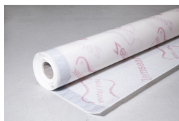
Zemseal® vanntettingssystem for understruktur