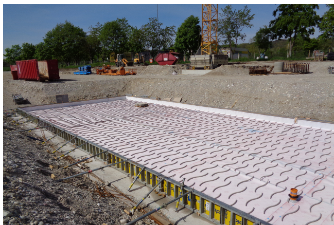
Base plate with waterproofing membrane Zemseal®