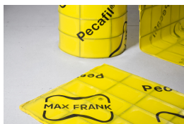
Pecafile® uniwersalny materiał szalunkowy