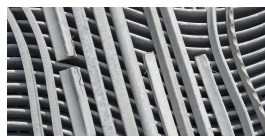
Dystanse liniowe z włóknobetonu.