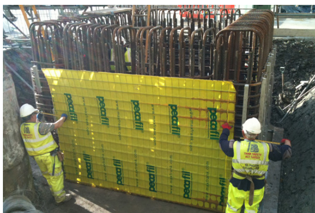
Pecafile® installation at Heathrow T2B